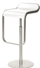
Art. 16022 Bar stool LEM white 75,30 €