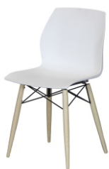
Art. 12120 Chair Calexpo white, wood 31,60 €