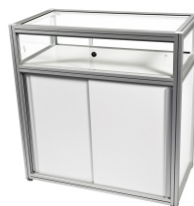
Art. 50111 Table glass cabinet 166,00 €