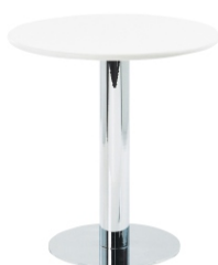
Art. 26000/26010 Bistro table chrome/white or black 26,20 € / 28,40