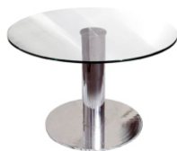
Art. 27050 Coffee table chrome/glass 62,00 €