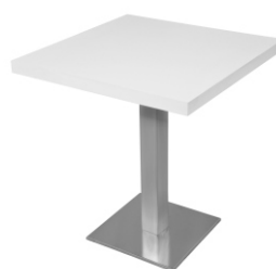
Art. 26120/26125 Bistro table stainless steel wh/bl 55,90 €