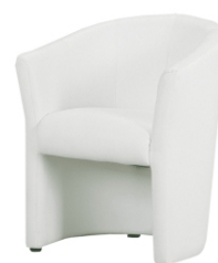
Art. 15000/15100 Clubchair black or 59,20 € / 68,10 €