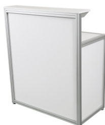
Art. 42305 Counter with composition 83,50 €