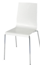
Art. 12680 Chair Kuadra 13,90 €