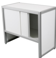
Art. 42295 Counter 69,10 €