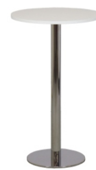
Art. 29405/29410 High table INOX white or black 41,20 € / 44,70 €