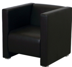
Art. 15015/15016 Armchair Qubo white or black 108,50 €