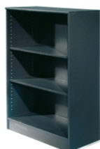
Art. 50206/50207 Filing shelf wh or bl, H 110 30,80 €