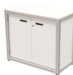
Art. 50020/50018 Sideboard white or black 69,10 €