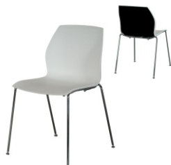
Art. 12112/12113 Chair Kalea wh/bl or wh/red 26,80 €