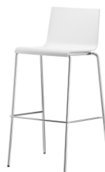
Art. 16680 Bar stool Kuadra white 27,50 €