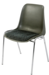
Art. 10130 Shell chair cushioned 9,90 €