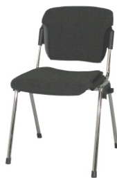
Art. 10261 Chair Flou anthracite 16,60 €