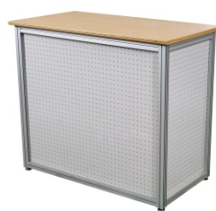
Art. 42451 Counter Magic 129,00 €