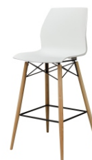
Art. 16122/ 16123 Bar stool Calexpo white or black 38,70 €