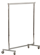
Art. 30001 Wardrobe rack chrome 29,60 €