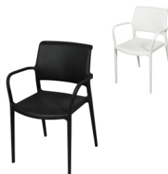
Art. 12095 / 12090 Chair ARA, black or white 18,60 €