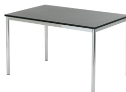
Art. 21021/21022 Meeting table white or black 120x80 33,10 €