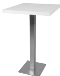
Art. 29120/29125 High table stainless steel w or b 68,60 €