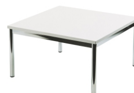
Art. 21081 Coffee table chrome/white 19,20 €