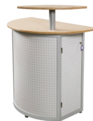
Art. 50631 Computer high desk 153,00 €