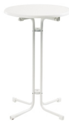
Art. 29010 High table white, foldable 26,80 €