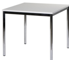
Art. 21001/21002 Meeting table white or black 80x80 29,00 €