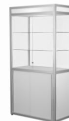
Art. 50121a High showcase H 200 lit-up 292,00 €