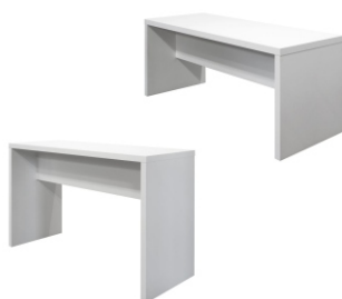
Art. 29034/29035 Highbridge table modulo 110 or lowbridge table modulo 75 120,70 €